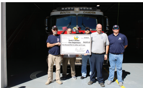
Members of the South Camden Fire Department were recently presented a $4,055.43 grant from the Albemarle Community Trust. The grant will be used to purchase equipment designed to contain electric vehicle fires.