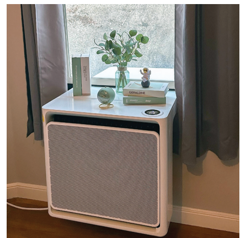
This Gradient saddle-mount, window unit heat pump could be the future of efficient heating and cooling for residences with inefficient, legacy heating systems.

Even so, the design and effectiveness of this new style of heat pumps are exciting, especially if the cost comes down as they become more widely adopted.